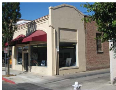
Alley Corners. The complementary wall treatment and window extend this building's façade into the adjacent alley.