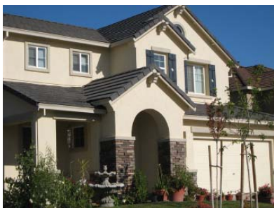
Proportion. The windows, entry arch, and other elements are well-proportioned.

Throughout the document, photographs are used to illustrate good examples of the project designs the City is seeking in future developments. A glossary, detailed checklists, and a list of applicable general plan policies are also provided to assist in the design of projects by architects and developers, and review of projects by staff, the Planning Commission, and City Council.